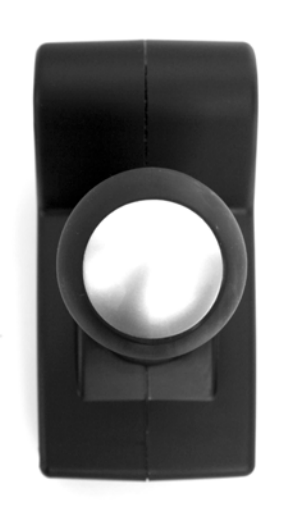
Seq gear stick

4. Description of buttons and accessories 4.3 Shifter